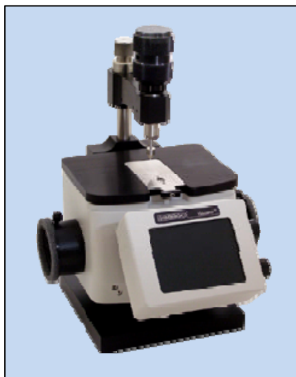
Figure 1. The VideoMVP™ Single Reflection Diamond ATR Accessory.