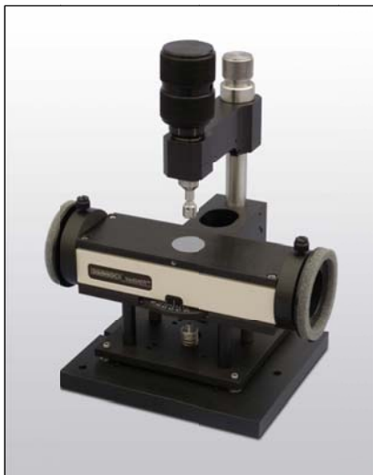
Figure 1. The VariGATR grazing angle ATR accessory.