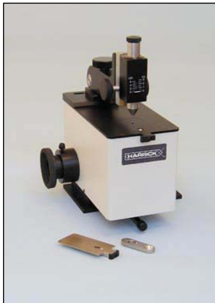
Figure 1. The SplitPea™ ATR Microsampler.