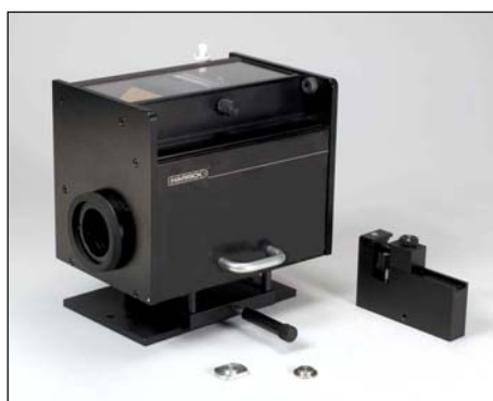
The Seagull Variable Angle Reflectance Accessory.

Below are examples of FTIR measurements of SAM's formed from acetyl and benzoyl blocked octadecanethiol using two different techniques. The collection parameters for all three spectra are the same and it can be noted that the SAM's are barely visible using typical grazing angle reflectance. Using the Seagull with a Ge crystal though, the SAM's are easily detected with peaks around 2917 and 2850 \text{cm}^{-1} attributed to the \text{CH}_2 groups in the alkyl chain and peaks at 2965 and 2877 \text{cm}^{-1} attributed to the \text{CH}_3 group. The variable angle allows the optimization of the angle for the best sensitivity of the films that in this case is 65 degrees.