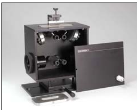
Figure 1. The Horizon ATR Accessory.