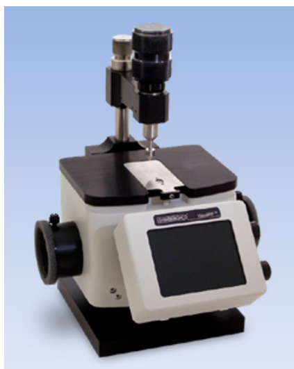
Figure 1. The VideoMVP™ Single Reflection Diamond ATR Accessory.