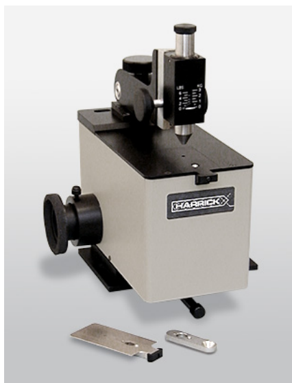
Figure 1. The SplitPea™.