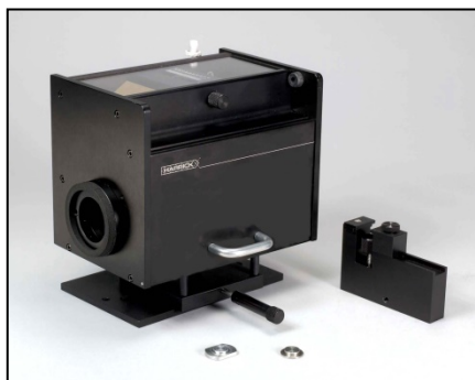
Figure 1. The Seagull™ Variable Angle Reflectance Accessory.

Subtle changes have been observed in the synchrotron X-ray diffraction patterns of hair from breast cancer patients. 1 In the cancer hair, one or more rings of comparatively low intensity were superimposed at specific locations on the normal hair alpha keratin pattern. These changes suggest that compositional and/or conformational changes have occurred in the lipid and/or protein materials within the matrix associated with the intermediate filaments of the hair fiber. In order to demonstrate whether these changes could be seen on the infrared spectra of these hairs (without the necessity of physically removing the cuticle, which could alter the cortex), the effective penetration depth of the evanescent wave of the IR beam into the composite structure of the hair fiber had to