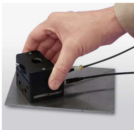
Figure 1. Omni-Spec specular reflection fiber optic probe.