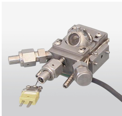
Figure 2. The Harrick High Temperature Reaction Chamber.