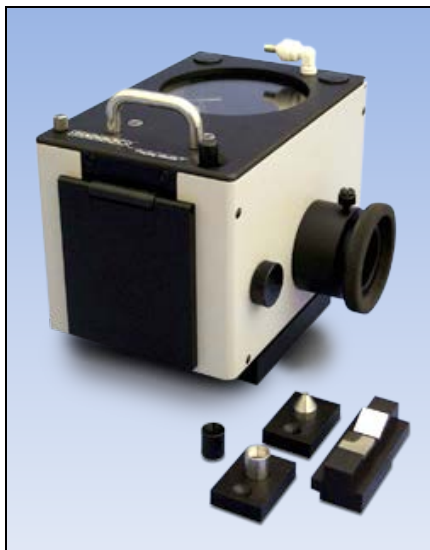
Figure 1. Harrick Praying Mantis UV-Vis Diffuse Reflectance Accessory.