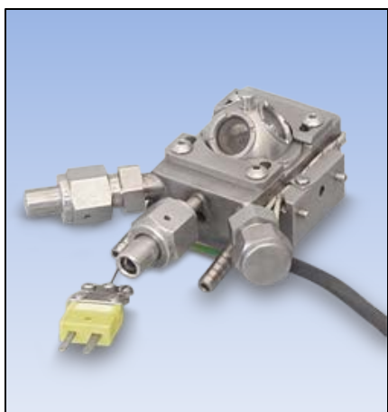
Figure 2. Harrick High Temperature Reaction Chamber.