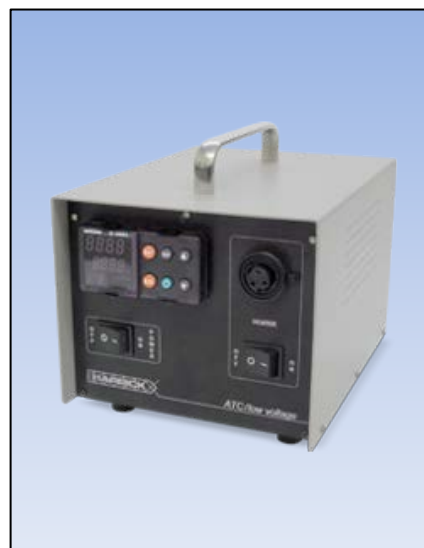
Figure 2. Temperature Controller .