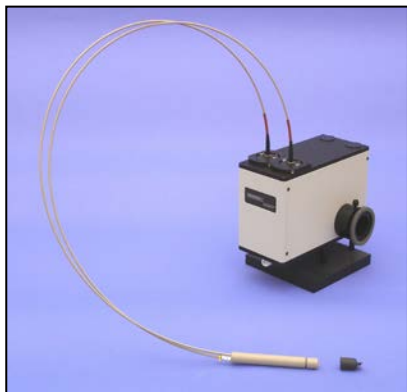
Figure 1. The FiberMate™ fiber optic coupler shown with the MultiLoop-MIR™ fiber optic probe.