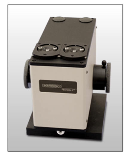
Figure 2. The FiberMate 2^{TM} fiber optic coupler.