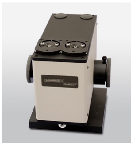
Figure 2. The FiberMate2™ fiber optic coupler.