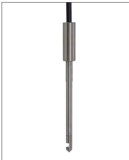
Figure 1. The Immersion Probe.