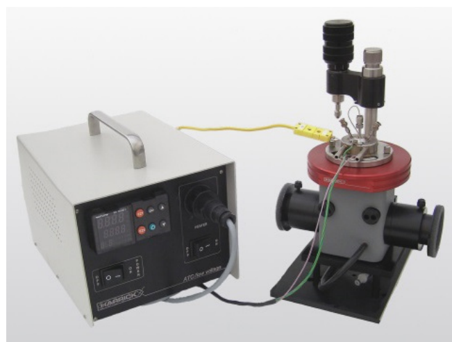
Figure 1. The DiaMaxATR™ with its heated cell and temperature controller.

The resulting spectra shows changes in the band shapes around 3276 cm -1 and 1640 cm -1 with time, as the water is evaporates and the primary component becomes that of the bound O-H in the sugars. The spectra show the expected peaks from sugars: those in the 900-1150 cm -1 region are from the C-O and