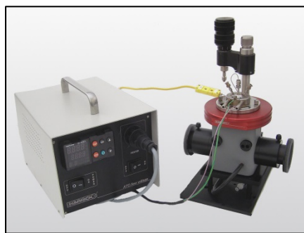
Figure 1. The DiaMaxATR™ with its heated cell and temperature controller.