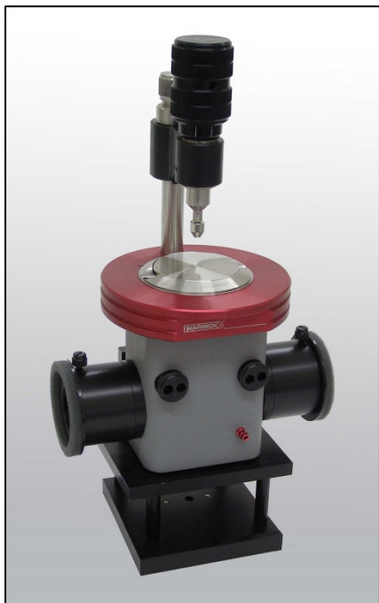
Figure 1. The DiaMaxATR™ diamond ATR accessory.