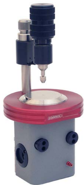
Figure 1. The DiaMaxATR .