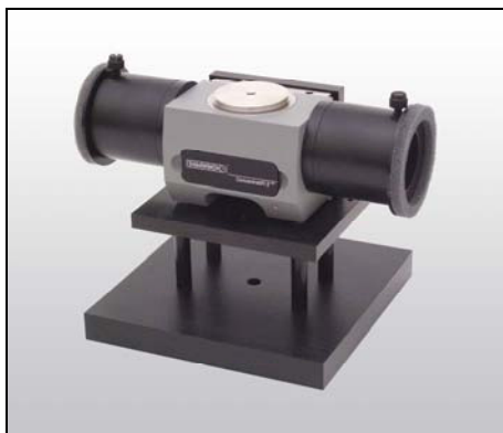
Figure 1. ConcentratIR2 Multiple Reflection Accessory

To further distinguish peaks, the spectrum of water was subtracted from the sample spectra. This resulted in the appearance of several C–H bands in the 3100\text{ cm}^{-1} to 2800\text{ cm}^{-1} region (Figure 3). Once