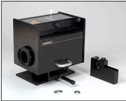
Figure 1. The Seagull™ Variable Angle Reflectance Accessory.

Subtle changes have been observed in the synchrotron X-ray diffraction patterns of hair from breast cancer patients. 1 In the cancer hair, one or more rings of comparatively low intensity were superimposed at specific locations on the normal hair alpha keratin pattern. These changes suggest that compositional and/or conformational changes have occurred in the lipid and/or protein materials within the matrix associated with the intermediate filaments of the hair fiber. In order to demonstrate whether these changes could be seen on the infrared spectra of these hairs (without the necessity of physically removing the cuticle, which could alter the cortex), the effective penetration depth of the evanescent wave of the IR beam into the composite structure of the hair fiber had to