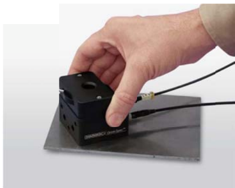
Figure 1. Omni-Spec specular reflection fiber optic probe.

Specular reflection fiber optic probes such as the Omni-Spec can be used effectively to examine coatings and residues on large, curved metal surfaces, provided that care is taken in positioning the probe relative to the sampling surface. The Omni-Spec fiber optic probe operates outside of the spectrometer sample compartment, making it a useful tool for examining large samples.