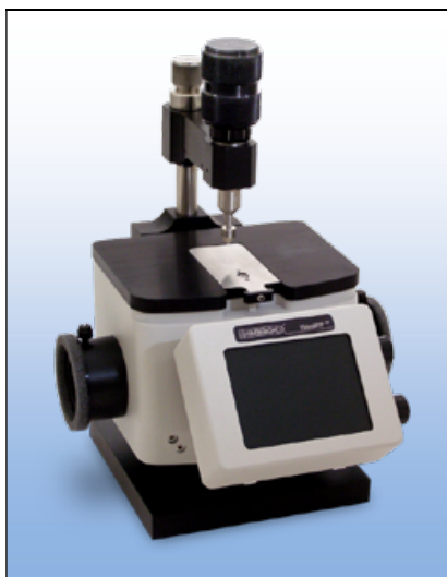
Figure 1. The Harrick VideoMVP.