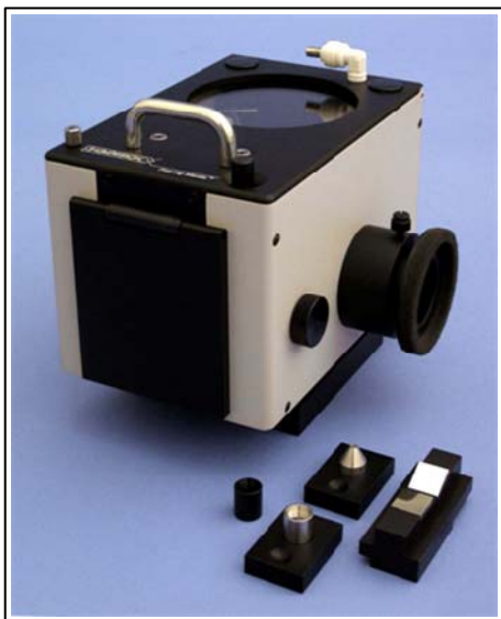
Figure 1. The Praying Mantis Diffuse Reflectance Accessory.